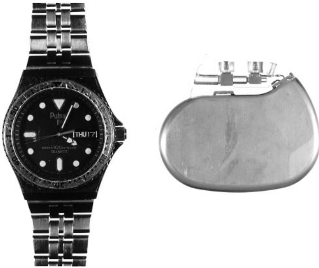
Figure 1. A modern pacemaker.

patients carry an identification card that provides specific information on the type of leads and pacemaker implanted (Figure 3). Such a card can be shown to healthcare professionals during medical evaluations and to security personnel at airports.